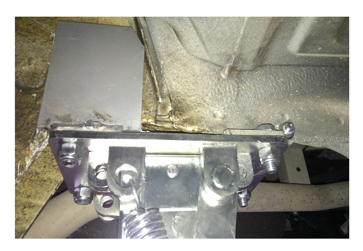
JACK WITH MOTOR TO THE OUTSIDE OF THE VEHICLE AND ROTATION REAR